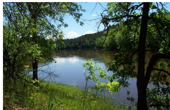
Photo: Mississippi River Overlook, City of Baxter

Opportunities for local governments to acquire and protect natural and scenic areas statewide are diminishing due to development, especially in high growth areas, shore lands, bluff tops and areas where land use changes may limit future opportunities. These areas complement state protected areas and provide close to home natural resource-based benefits.