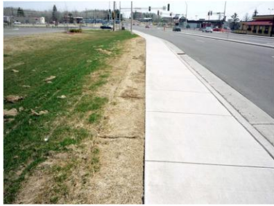
Effects of de-icing agent on the vegetation of the road shoulder

Environment and Natural Resources Trust Fund-2022