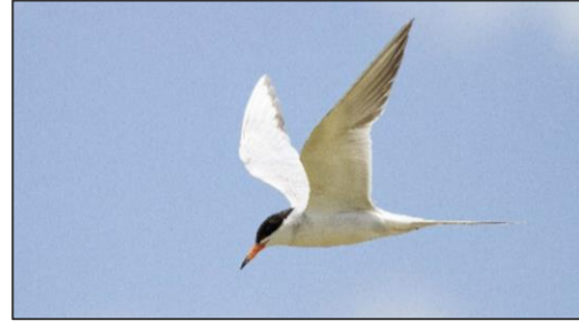
Forster's Tern in flight