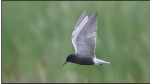
Black Tern in flight.

Problem: Marsh-nesting tern species have declined significantly throughout their range in North America, including in Minnesota.