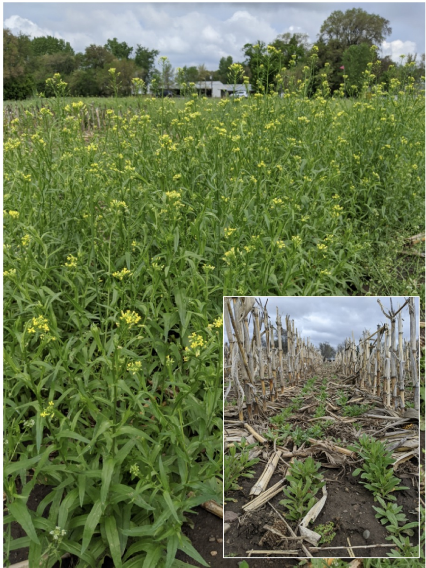
Winter camelina in flower, and double cropped into silage corn.