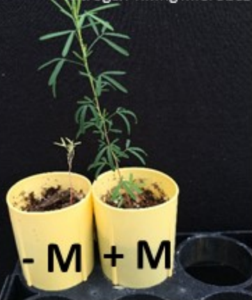
Dalea benefits from Nitrogen-fixing microbes

Activity 3: Adaptive genetic diversity of prairie plants. Map of remnant prairie collection sites (blue = SNA, red = TNC) and 3 evaluation sites (green). Seeds of 6 different species from 16 sites are grown in the three evaluation sites to assess capacity for adaptation to differing environmental conditions.