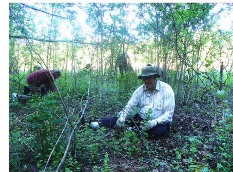
Minneapolis River Gorge – This project will remove both woody and herbaceous invasive plants - like the garlic mustard and buckthorn pictured here. Native species will be planted, improving wildlife habitat.