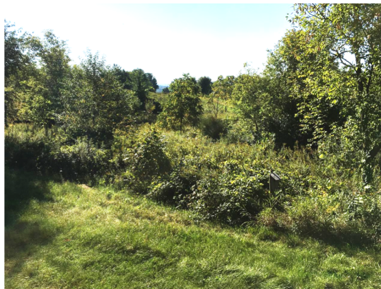
River Heights Park, Inver Grove Heights – FMR will establish native prairie and pollinator plantings, and remove invasive and non-native plants such as the invasive shrubs pictured here.

All sites are within the Mississippi National River and Recreation Area corridor.