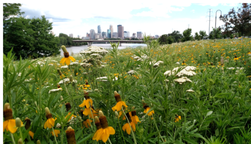
Ole Olson Park, Minneapolis – Additional restored acres will add to, and resemble, this land restored in Phase I.