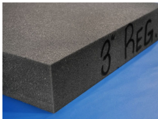
insulation foam; www.foambyemail.com