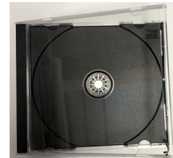
CD jewel case