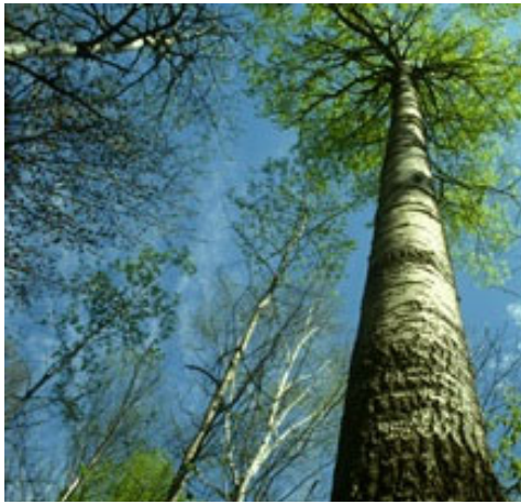
Aspen often grows in nearly pure stands.