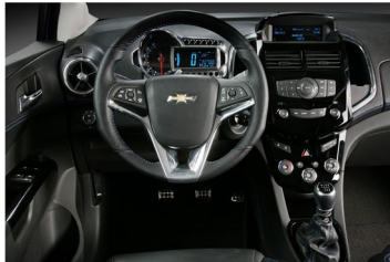
automobile dashboard