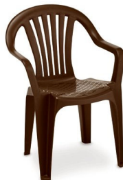
plastic chair, True Value