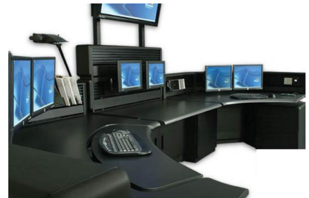
computer console

Reduced Climate Change, Less Pollution from Plastics Better Environmental Stewardship