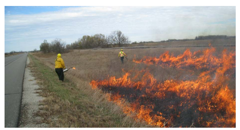
Figure 3: Prescribed fire in progress on a roadside prairie remnant