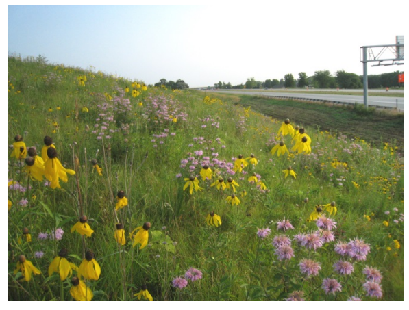
Figure 1: Roadside native grass and wildflower planting