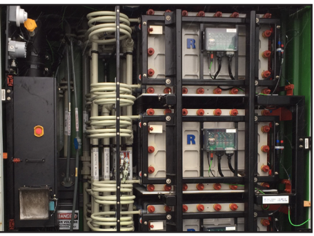
interior of flow battery