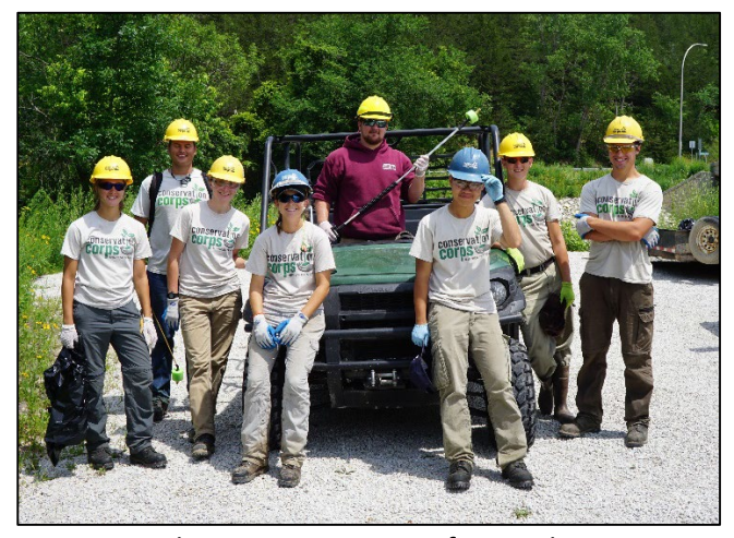
To prepare the next generation of natural resource managers, Conservation Corps crew members learn invasive plant biology, identification, detection and management.