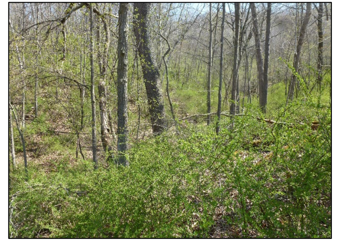
Japanese barberry's green leaves stand out in this infestation that overwhelmed native wildflowers and other understory plants. The infestation threatens forest regeneration and is ideal deer tick habitat.

Distribution maps inform management priorities by defining invasion fronts and showing areas of small, isolated infestations that could be controlled before they spread.