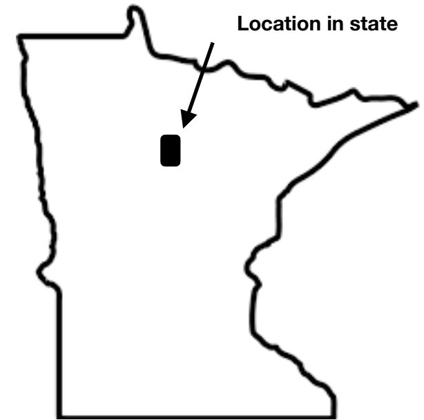
Location in state