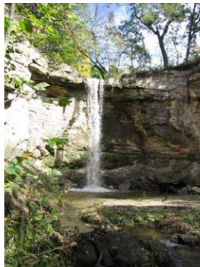
Photo: Minnemishinona Falls, Nicollet County

Opportunities for local governments to acquire and protect natural and scenic areas statewide are diminishing due to development, especially in high growth areas, shore lands, bluff tops and areas where land use changes may limit future opportunities. These areas complement state protected areas and provide close to home natural resource-based benefits.