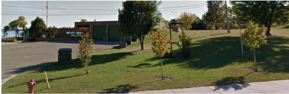
Street view of planned center from the north. Currently a vacant fire hall.