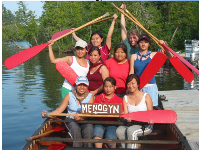
Past Program Participants on their Multi-Day Wilderness Canoe Experience in the Boundary Waters.