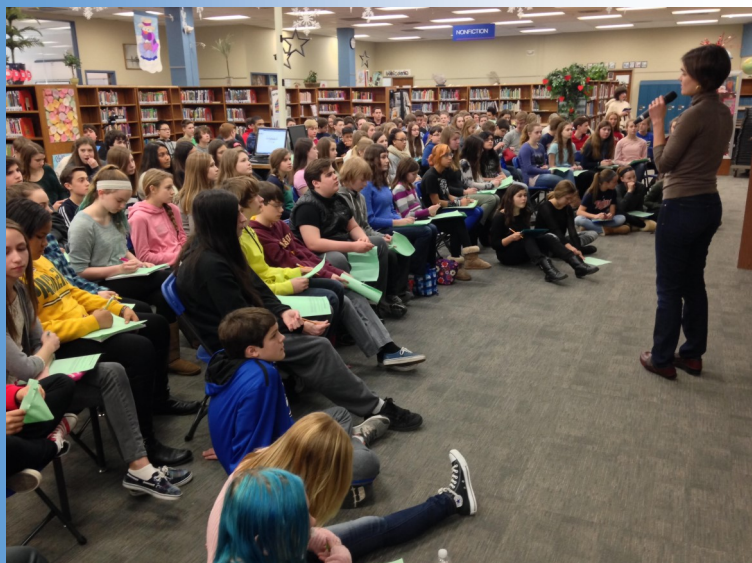
Connecting Students to the Boundary Waters Through Classroom Education.