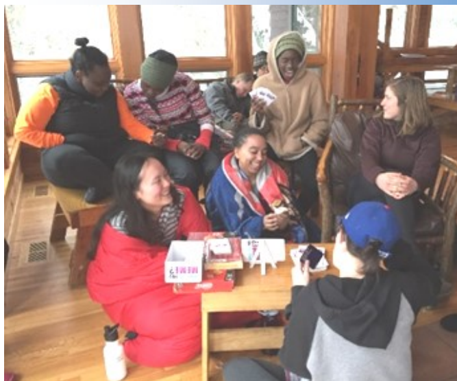
Team Building and Leadership Development at Camp Menogyn.