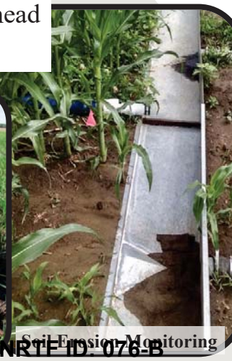
Soil Erosion Monitoring