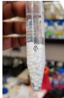
Prototyped ecological water filters