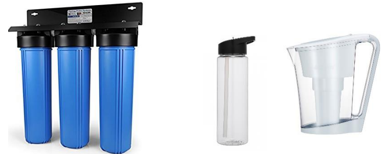
Optimized ecological water filters for water plants and personal uses