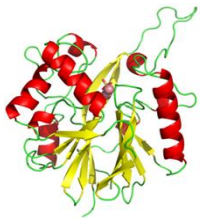
Ecological protein cleaning insecticides

Our proposal: Water filters infused with ecological proteins, isolated from Minnesota ecosystems, that destroys pollutants and clean water