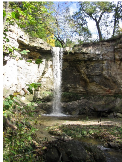
Photo: Minnemishinona Falls, Nicollet County

Opportunities for local governments to acquire and protect natural and scenic areas statewide are diminishing due to development, especially in high growth areas, shore lands, bluff tops and areas where land use changes may limit future opportunities. These areas complement state protected areas and provide close to home natural resource-based benefits.