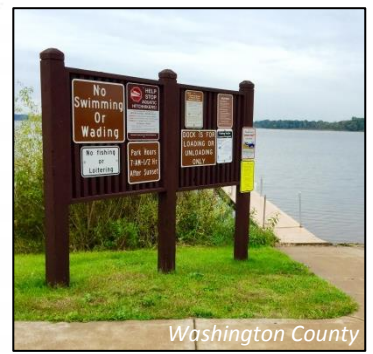
Zebra mussels discovered in Forest Lake, 2015