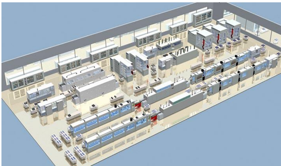
Current Silicon Solar Cell Production Line from CETC (Very Complex and Expensive)