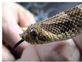
Plains Hognose Snake