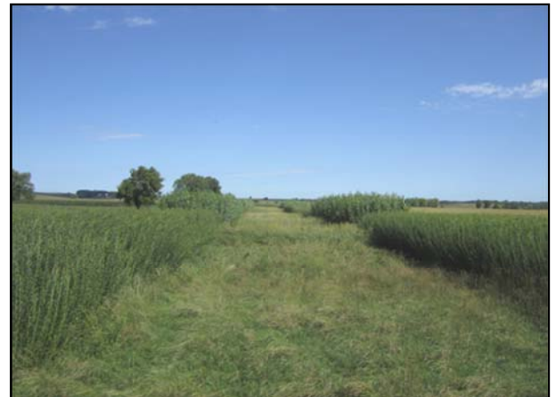
An example of an alley cropping system that can be employed for expiring CRP land that maintains environmental functions and expand economic benefits.

As continuous living cover for expiring CRP lands, alley cropping can: