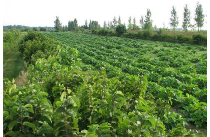
Hazelnut-pumpkin alley cropping system for income diversification and environmental benefits in