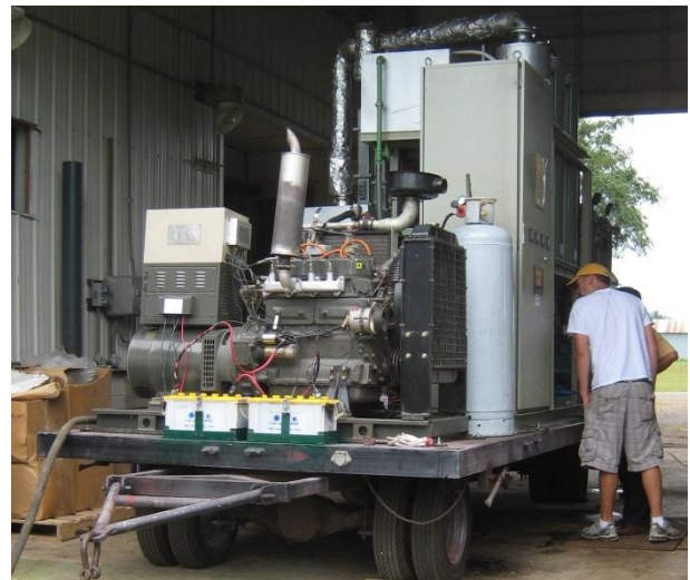
Figure 3. Pilot scale mobile MAP system developed through previous LCCMR and other projects; with incorporation of microwave absorbents, it becomes fMAP, a superior fast thermochemical conversion process.