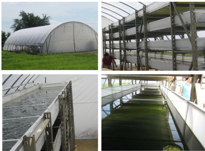
Figure 2. Pilot scale animal wastewater algae production facility in Rosemount, developed through previous LCCMR and other projects.