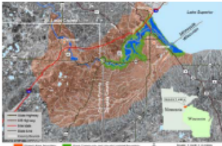
Left: St. Louis River long-term Indicator bacteria & water quality sites – WLSSD/USGS/MPCA/ Duluth surveys. Map-SLR CAC Habitat Plan