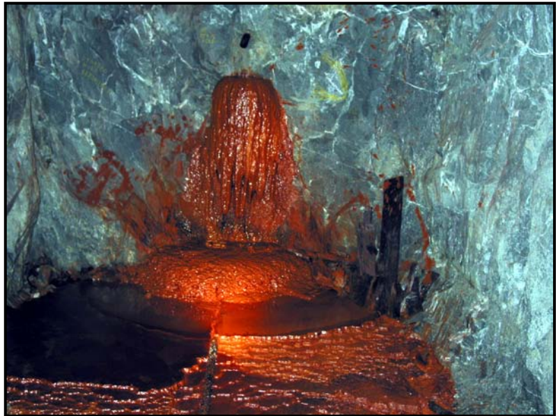
Figure 3. Biogenic Iron Oxide (Ferrihydrite) “Speleothem” Deposit in the Bottom, 27 th Level of the Soudan Mine.