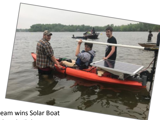
Wrenshall YES! team wins Solar Boat Regatta with student-built boat

I remember when I was little and the YES! team came into my classroom and told us about the projects they do and I wanted to be on the YES! team when I got bigger because I loved the hands-on learning about something I cared about, our environment. - New London-Spicer student