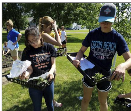
YES! students planting native species for a pollinator garden in Sleepy Eye