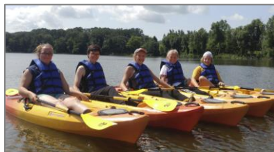
YES! students monitor Lake Ringo for Aquatic Invasive Species