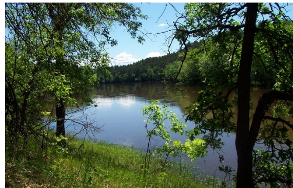
Photo: Mississippi River Overlook, City of Baxter

Opportunities for local governments to acquire and protect natural and scenic areas statewide are diminishing due to development, especially in high growth areas, shore lands, bluff tops and areas where land use changes may limit future opportunities. These areas complement state protected areas and provide close to home natural resource-based benefits.