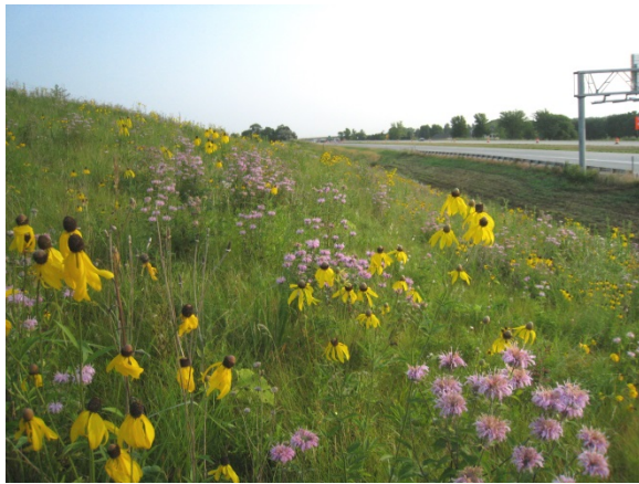
Figure 1: Roadside native grass and wildflower planting