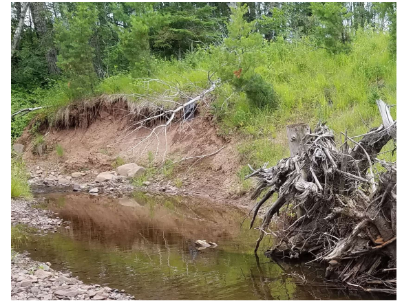
Same restored stream bank after flood damage