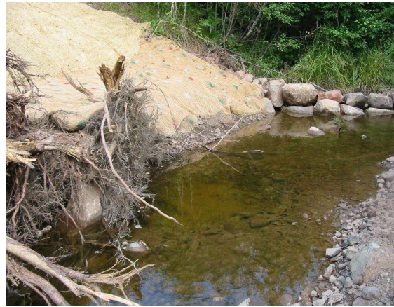
Same stream bank after restoration