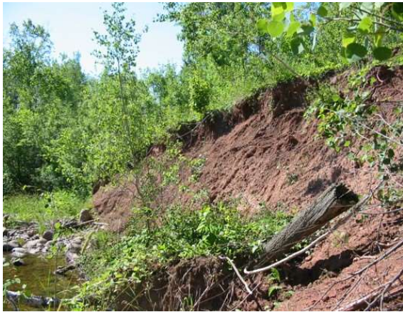
Northern Minnesota stream bank before restoration