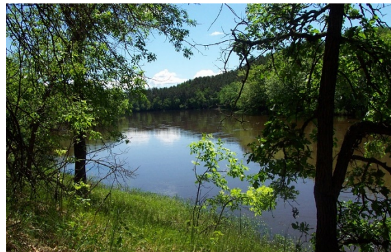
Photo: Mississippi River Overlook, City of Baxter

Opportunities for local governments to acquire and protect natural and scenic areas statewide are diminishing due to development, especially in high growth areas, shore lands, bluff tops and areas where land use changes may limit future opportunities. These areas complement state protected areas and provide close to home natural resource-based benefits.