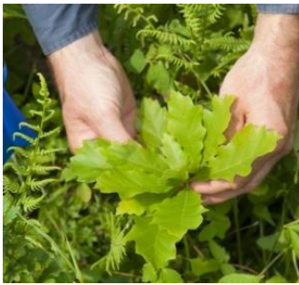
Swamp white oak