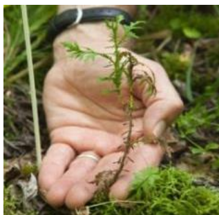
Northern white cedar

Activity 2: identify optimal replacement tree species to diversify black ash forests