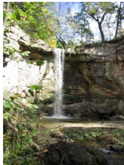
Photo: Minnemishinona Falls, Nicollet County

Opportunities for local governments to acquire and protect natural and scenic areas statewide are diminishing due to development, especially in high growth areas, shore lands, bluff tops and areas where land use changes may limit future opportunities. These areas complement state protected areas and provide close to home natural resource-based benefits.