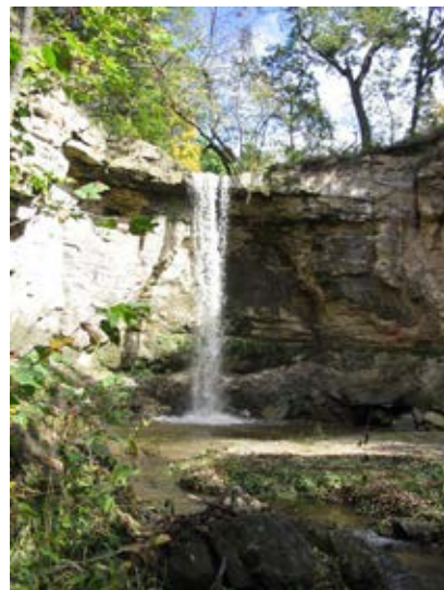
Photo: Minnemishinona Falls, Nicollet County

Opportunities for local governments to acquire and protect natural and scenic areas statewide are diminishing due to development, especially in high growth areas, shore lands, bluff tops and areas where land use changes may limit future opportunities. These areas complement state protected areas and provide close to home natural resource-based benefits.