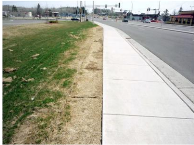
Effects of de-icing agent on the vegetation of the road shoulder

Environment and Natural Resources Trust Fund-2019