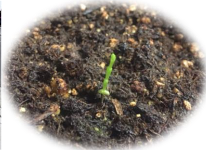
Glasswort Salicornia Rubra is a native plant growing in a few salty lakes in Western Minnesota