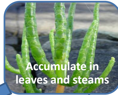
Accumulate in leaves and stems