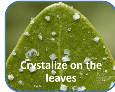
Crystallize on the leaves