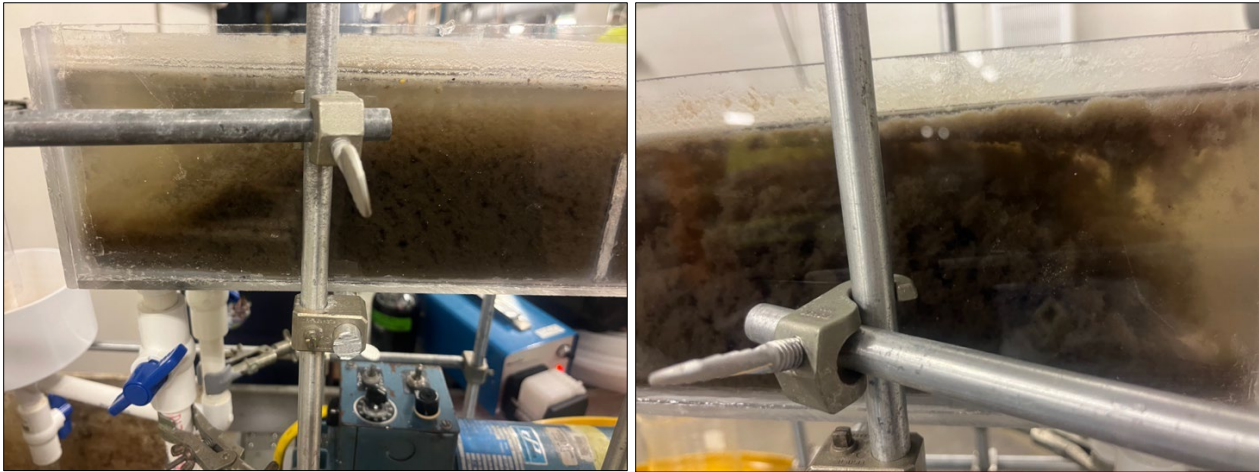
Figure 3. Ordinary settling in simulator on the left and enhanced flocculation on the right

Stabilized powdered activated carbon (S-PAC) was added to one side of the simulator via a small peristaltic pump at a flow rate of 4 milliliters per minute. The addition of the S-PAC created flocculation within the channel (Figure 3), and what visually appeared to be larger floc that remained suspended.