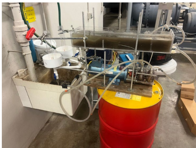
Figure 2. Simulated WWTP Channel set up at Brainerd

We constructed a simulated WWTP channel that had a mixing zone, a quiescent zone, and a settling basin and employed it at the Brainerd WWTP (Figure 2). The influent to the simulator was collected from one of the batch tanks at the plant during activated sludge aeration from a valve at the bottom of the tank and was introduced to the simulator via a large peristaltic pump at a flow rate of 1 liter per minute. Wastewater flowed through two parallel channels and back into a sink below the tank.