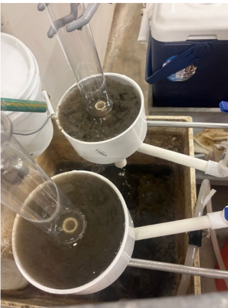
Figure 4. Treated settling basin (top) and untreated settling basin (bottom)

This flocculation carried through to the settling basins in the simulator, where the treated basin had clearer water with larger floc (Figure 4). Given sufficient settling, it is believed that this would result in lower suspended particulate matter in the treated wastewater.