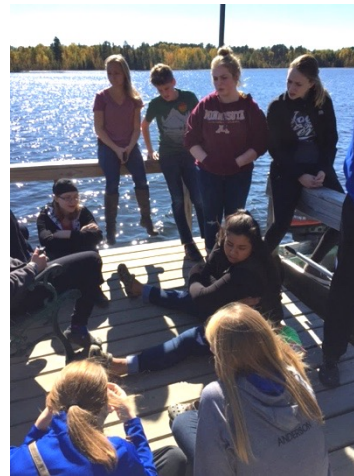
Carlton YES! team at Arrowhead Lake engage in aquatic ecology lessons.