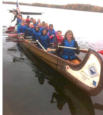
YES! teams in 35' Voyager Canoe conduct Secchi disk readings at Saint John's University.

YES! is ready to respond to the urgent need for broad citizen participation in efforts to protect and clean up Minnesota waters.