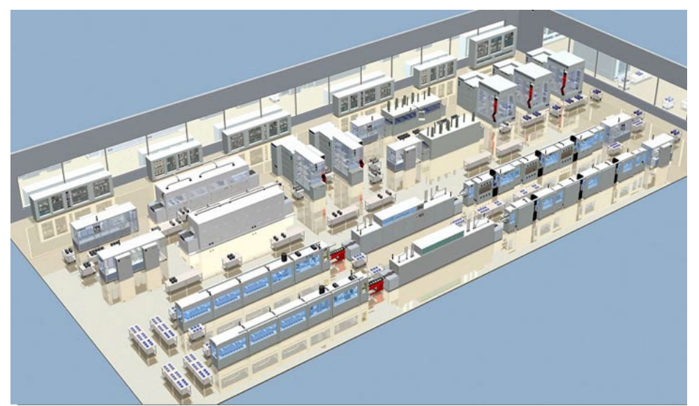
Current Silicon Solar Cell Production Line from CETC (Very Complex and Expensive)

Project Title: Develop Inexpensive Energy from Simple Roll-to-Roll Manufacturing (160-E)