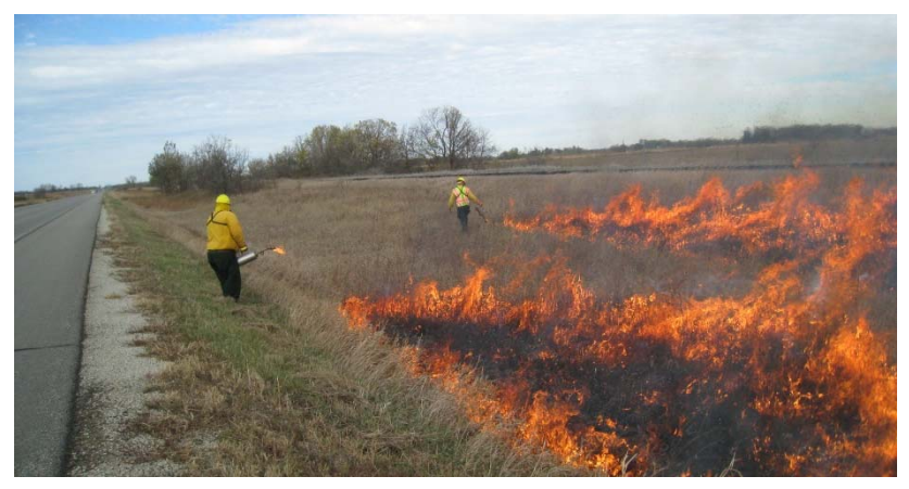
Figure 3: Prescribed fire in progress on a roadside prairie remnant