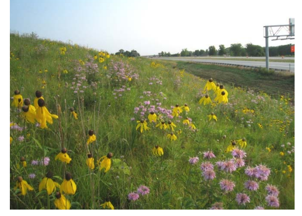
Figure 1: Roadside native grass and wildflower planting