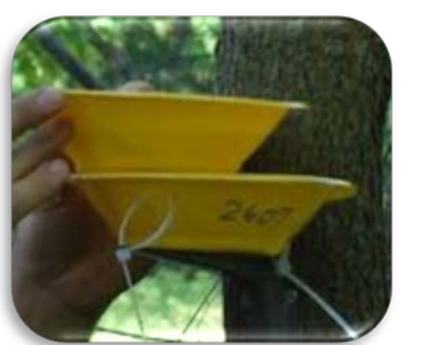
Adult parasitoid wasp recovery