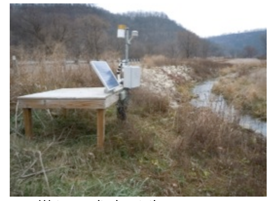
Water monitoring station on Garvin Brook.