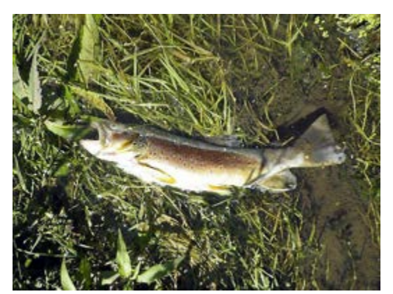
MN DNR photo of a dead trout at South Branch Whitewater River, 30 July 2015.