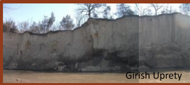
A massive failure in the summer of 2014 didn't damage any infrastructure. It was caused by high sediment loads in the Minnesota River watershed.