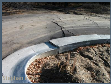
Slow mass wasting between 2012 and 2015 in Moorhead damaged this new fishing pier that was later removed.