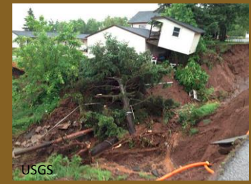
Flooding in the Summer of 2012 caused landslides leading to significant infrastructure damage in Duluth.