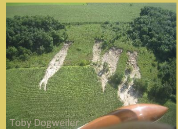
Landslides in southeastern Minnesota can be agricultural fields.