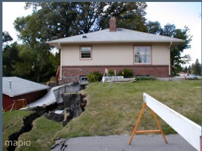
Landslides in Crookston has led to compromised house foundations.