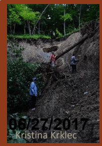
June 2014 in Henderson several landslides occurred on a ravine. One of these landslides destroyed a home causing well over $100,000 in damage.