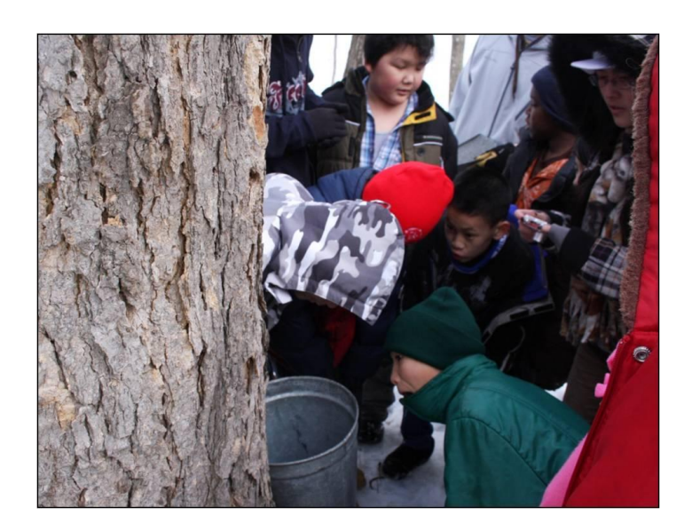
Page 8 of 8 11/30/2016 Subd. 0h - DRAFT