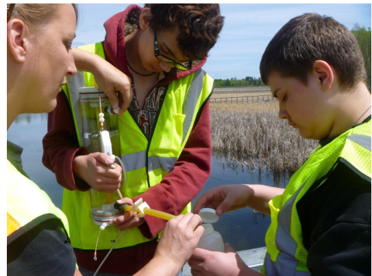
2012 RiverWatch/MPCA training with Headwaters Science Center youth crew.

Create watershed map using participant created data