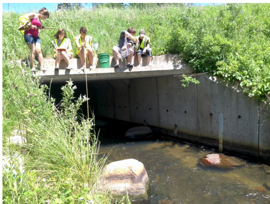
2012 RiverWatch/MPCA sampling completed by Headwaters Science Center youth crew. Shingobee River near Leech Lake, Cass County