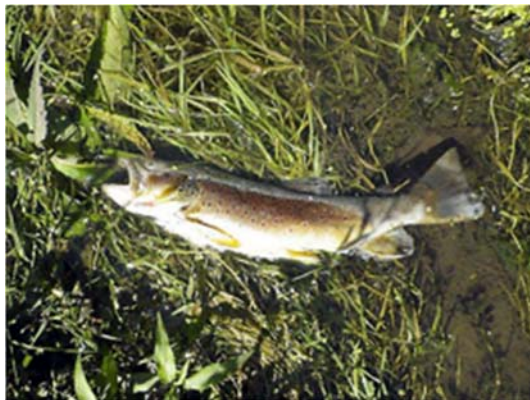
MN DNR photo of a dead trout at South Branch Whitewater River, 30 July 2015.