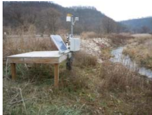
Water monitoring station on Garvin Brook.

List of 23 fungicides, herbicides, and herbicide degradate compounds detected in the South Branch Whitewater River, 2015.