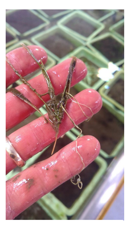
Figure 1. Vegetative propagule used to recolonize experimental plots with native macrophytes.

Following the summer 2020 field season, our team has begun the process of finalizing statewide data for publication as a public database. We are working now on a survey that will allow data contributors to review and verify metadata for the surveys submitted to-date and to