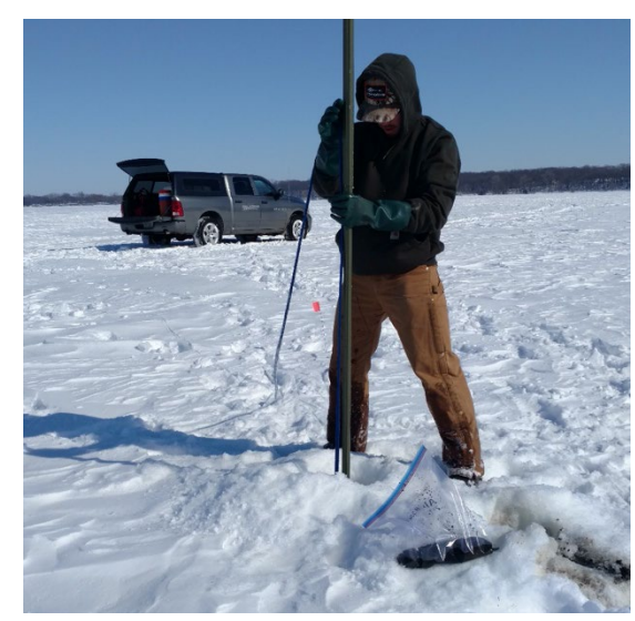
Figure 1: Project staff use an Ekman grab sampler mounted to a telescoping pole to collect sediment samples from each experimental plot through the ice. Winter sampling on the ice provides a stable platform and allows us to collect plant seeds and turions when they are dormant.

The statewide plant survey database continues to grow, with a QA/QC check of our database against contributed data resulting in 142 additional plant surveys (resulting in a new total of 3,546 surveys). These data were used to evaluate the environmental niches use by curlyleaf pondweed and Eurasian watermilfoil; results indicate that the dominance of these two species likely arises through different mechanisms.