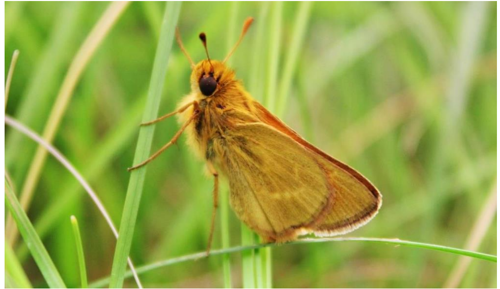
Male Dakota skipper reared from egg to adult at MNZoo. The Zoo successfully bred this species in 2014.