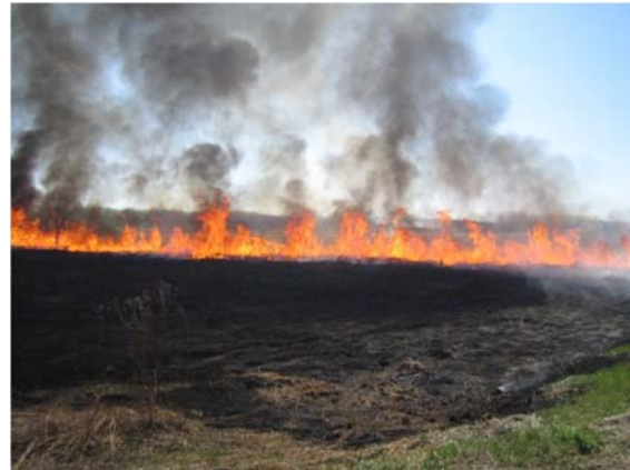
Prescribed fire in spring

Problem 2: Historically, wildfires occurred in all seasons: spring, summer and fall. Prescribed burns occur in spring. Cooler spring fires due to moist condition may hinder effective achievement of management goals.