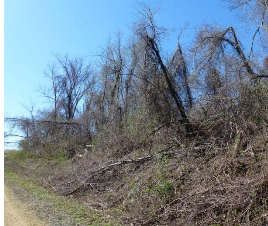
Oriental bittersweet vines overwhelming and killing trees in Red Wing