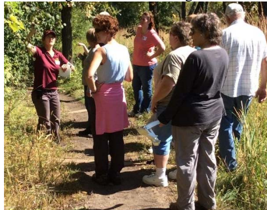
Training people to identify and report target species.

To prevent environmental and economic damage, we will detect, contain and control target species before they become widespread.