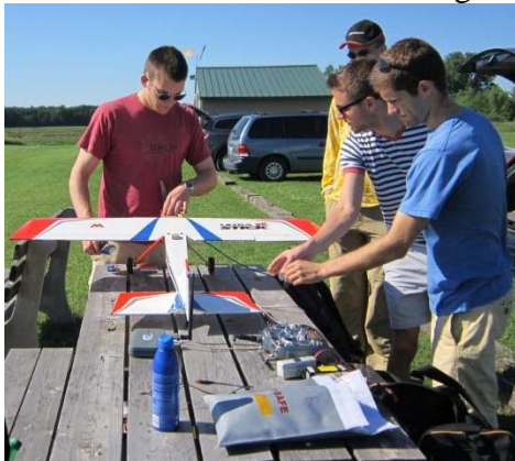
Unmanned Aerial Vehicle Lab students will test a drone for survey