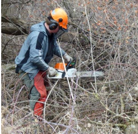
Conservation Corps controlling Oriental bittersweet in Red Wing