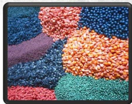
Neonicotinoid treated seeds