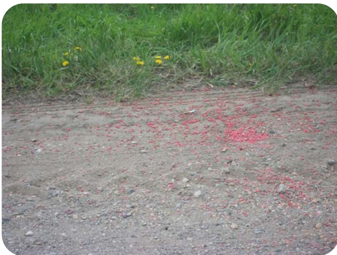
A treated seed spill