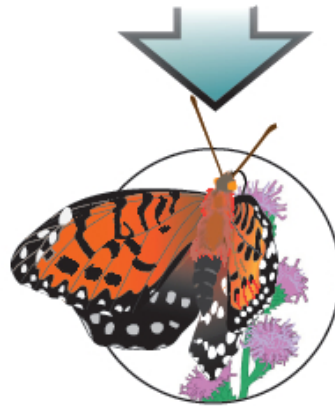
prioritized habitat conservation