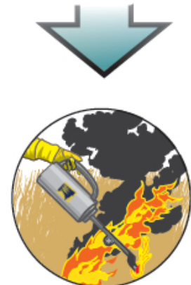
focused habitat management