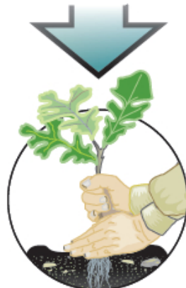
effective habitat restoration