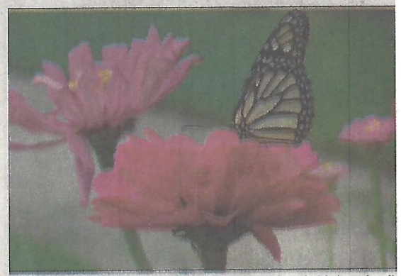
A new pollinator park will be installed near the Brookside boat landii See PARK, Page C3 on June 3.